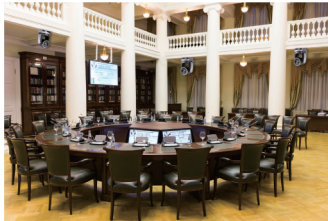
Multiple Camera Auto Switch