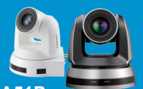
VC-A51P Full HD PTZ Camera