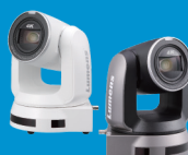
VC-A71P 4K 60fps IP PTZ Camera