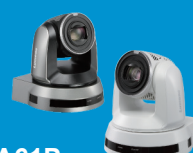
VC-A61P 4K 30fps IP PTZ Camera