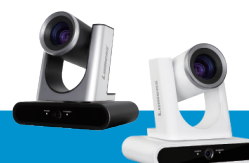
VC-TR40 AI Auto-Tracking Camera