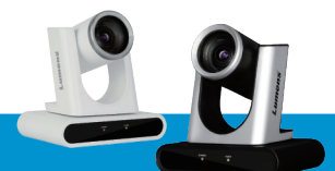
VC-R30 Full HD IP PTZ Camera