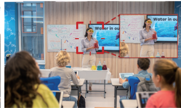
Hybrid Audio-Visual Tracking Algorithm